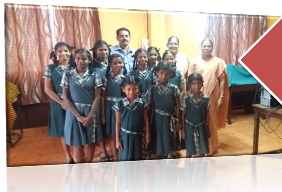
7. St. Euphrasia's Scholarship Fund: