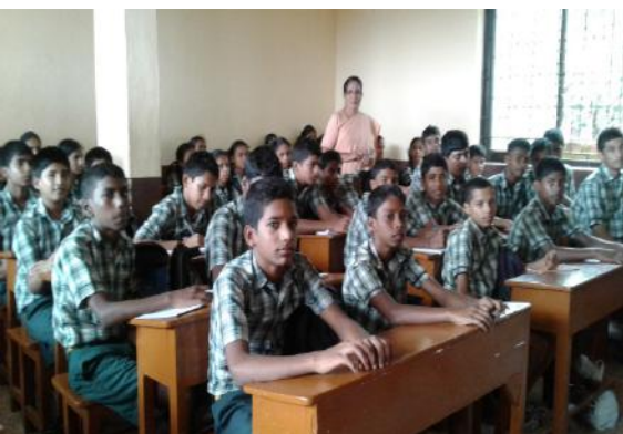
6. Value Education at St. Rock's High School: